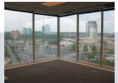
Views from 9th Floor